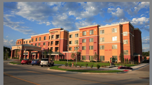
Scott Conference Center 6450 Pine Omaha, NE 68106

NUCA of Nebraska has a block of rooms available at the Courtyard Aksarben Village for Friday, February 7, 2020. The room rate is $89.00 for a King room and $119.00 for double Queen room. To make a reservation call the hotel directly at 402-951-4300 or 888-236-2427 and ask for the National Utility Contractors Association of Nebraska group rate. Registrations must be received before January 24, 2020.