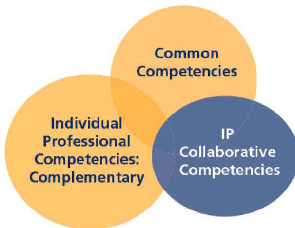
Barr's Three Types of Professional Competencies